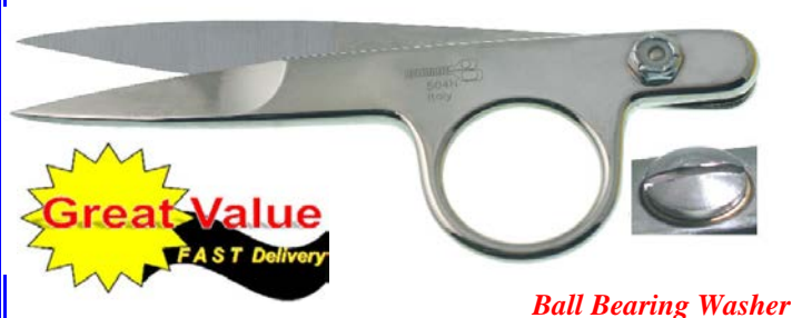
#504N 4-1/2" Length (1-1/4" cut) for smooth movement

Nipper comfortably fits hand leaving fingers free to handle material Balanced long life springs for effortless performance